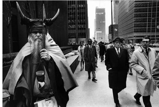
Moondog, East 51st Street, New York (1970-1979).

In the 1960's and 70's many of The Rehearsal Club women made friends with a gentleman named Moondog, who stood on the corner of West 53 rd Street and 6 th Avenue. Moondog dressed as a Viking, complete with staff and helmet. Moondog was blind and was a poet and musician. He asked for donations in exchange for his poetry. Moondog became a famous musician in Europe with a cult following of thousands. TRUE!